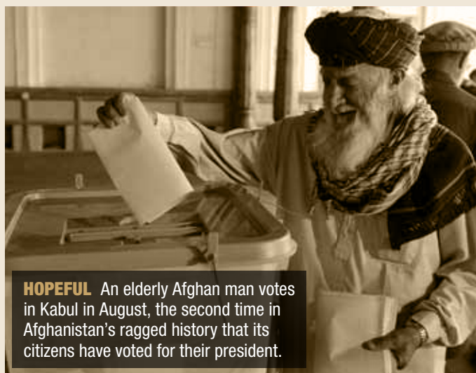
HOPEFUL An elderly Afghan man votes in Kabul in August, the second time in Afghanistan's ragged history that its citizens have voted for their president.

Two thirds of the population—including 85 percent of the