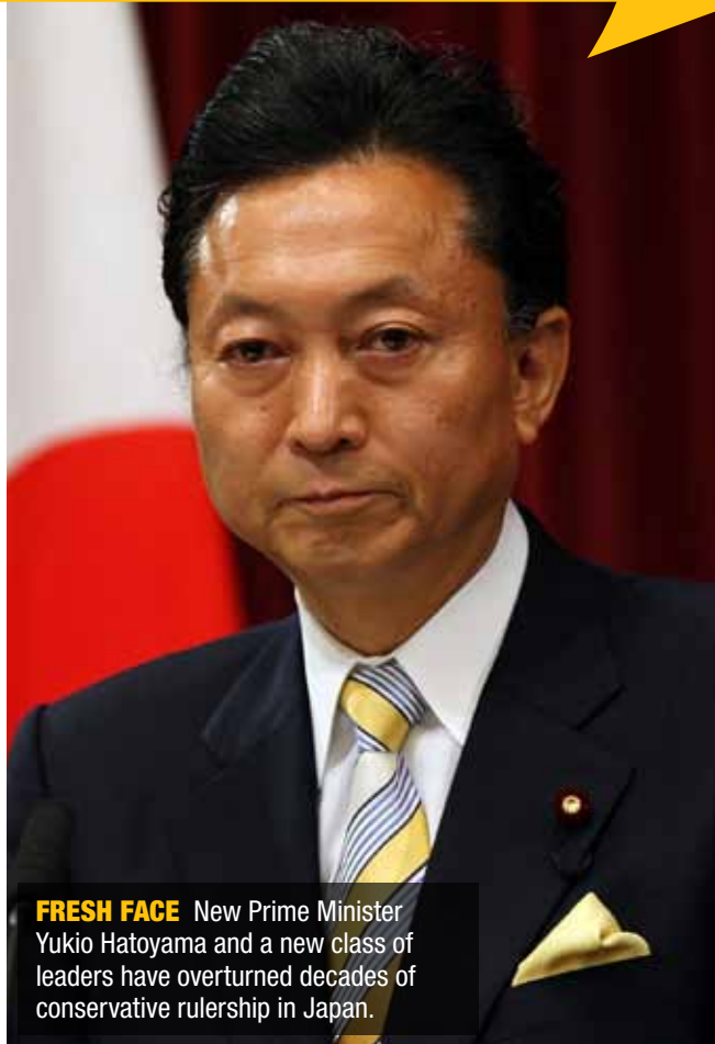
FRESH FACE New Prime Minister Yukio Hatoyama and a new class of leaders have overturned decades of conservative rulership in Japan.

There is a bold movement occurring in Asia. Old animosities are being forgotten or resolved. “I believe that regional integration and collective security is the path we should follow,” Hatoyama reiterated.