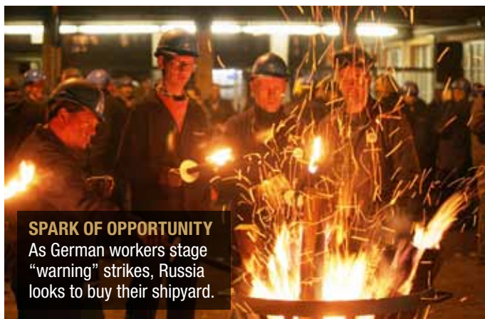
SPARK OF OPPORTUNITY As German workers stage "warning" strikes, Russia looks to buy their shipyard.

The Christian Science Monitor claimed August 20 that Zimbabwean President Robert Mugabe and his Zanu-PF party are targeting