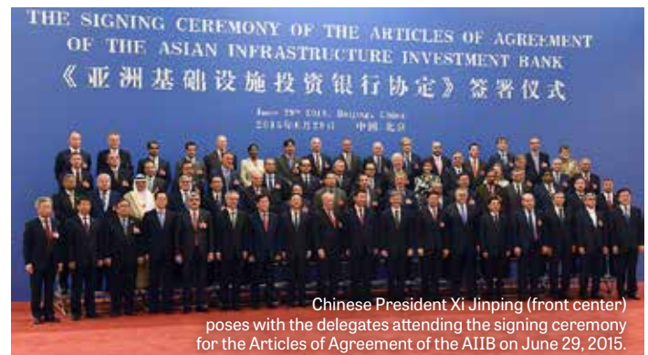
Chinese President Xi Jinping (front center) poses with the delegates attending the signing ceremony for the Articles of Agreement of the AIIB on June 29, 2015.

It's impossible to review Russia's navigation through 2015 without placing it in the context of the pivotal year that preceded it. In 2014, Russian President Vladimir Putin shocked the world by annexing the Crimean Peninsula. By making this peninsula part