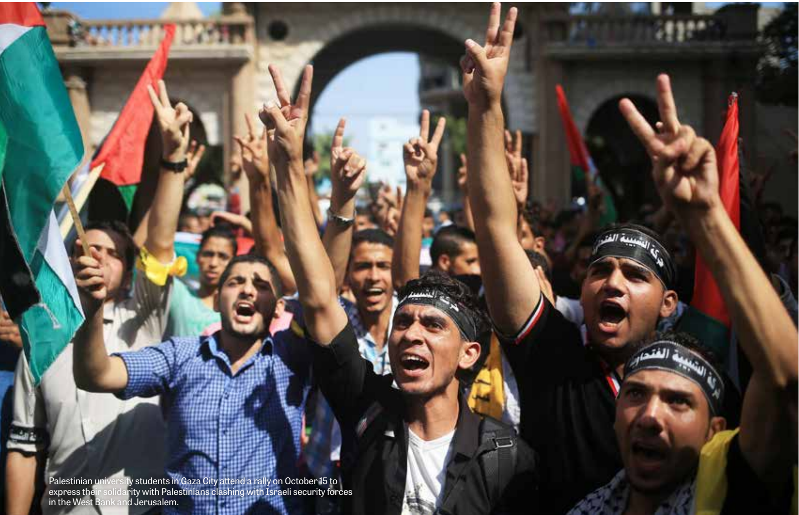
Palestinian university students in Gaza City attend a rally on October 15 to express their solidarity with Palestinians clashing with Israeli security forces in the West Bank and Jerusalem.