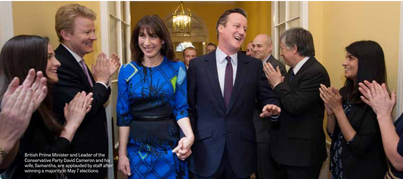
British Prime Minister and Leader of the Conservative Party David Cameron and his wife, Samantha, are applauded by staff after winning a majority in May 7 elections.