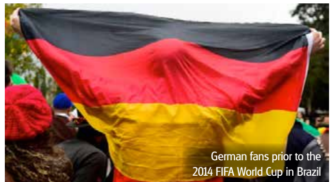
German fans prior to the 2014 FIFA World Cup in Brazil

In Germany, people partied “in celebration of their soccer victory, but perhaps also of something bigger: a new, non-threatening pride and confidence that Germany has allowed itself to feel now that it is finally one strong