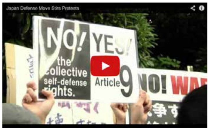
Protests erupted in Tokyo and Seoul over Japanese Prime Minister Shinzo Abe's decision to reinterpret Article 9 of the constitution on July 1.

Gen. Douglas MacArthur and the U.S. officials who wrote Japan's constitution were experienced and world wise. If they were around today, they would recognize Japan's shifting tides and take action to reverse them. But U.S. leaders today are snubbing history, turning inward and pushing for dangerous geopolitical shifts. The barriers established to prevent another world war are being systematically dismantled.