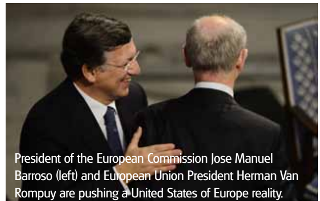
President of the European Commission Jose Manuel Barroso (left) and European Union President Herman Van Rompuy are pushing a United States of Europe reality.

Most European Union nations will combine together to form a United States of Europe, European Commission Vice President Viviane Reding said in an interview published