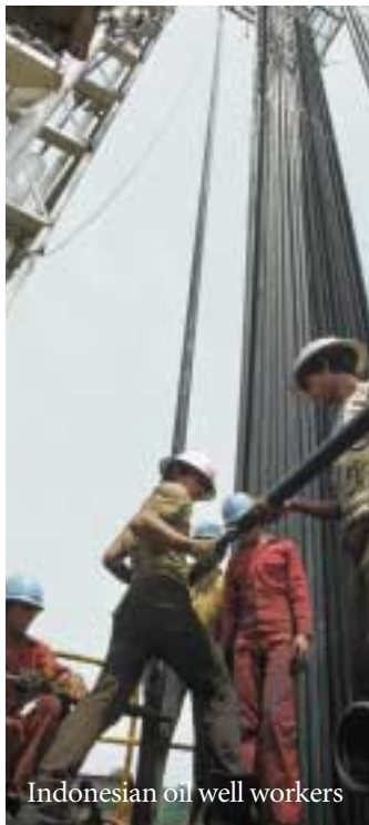
Indonesian oil well workers

Even after Suharto's resignation, enormous forces of anarchy, especially radical Islam, remain active in the streets of Indonesia, only awaiting a spark to re-ignite them. As witnessed in the mid-1960s, Indonesian-style vio-