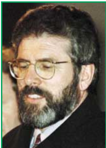
The politician: Sinn Féin leader Gerry Adams is pushing for the release of former terrorists from prison.

South]. It will be sought while the IRA is holding a gun to the head of every voter" (The Week, May 9).