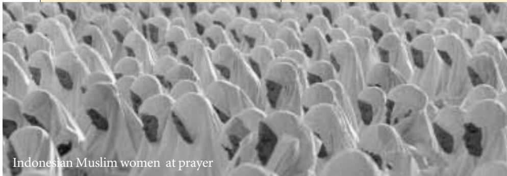
Indonesian Muslim women at prayer

The prophet Daniel wrote about a future confrontation between the king of the north and the king of the south. The king of the north will be comprised of the United States of Europe. But which nations will form the king of the south? Is this power now forming?