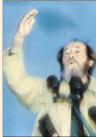
ON THE COVER: Nobel Prize winning author Alexander Solzhenitsyn.

This year's American foreign-policy failures are there for all to see—and they highlight the shifting tides of global power.