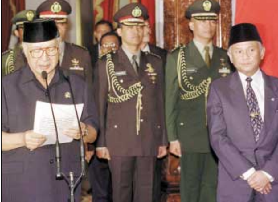
No solution: After months of ruckus, Suharto (left) resigned power to Habibie (right).