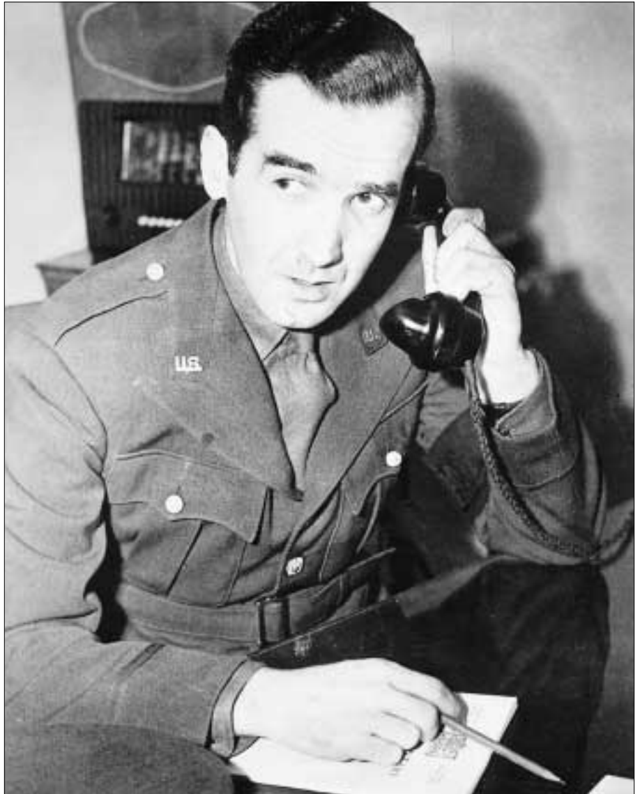
Death of a newsman: Murrow's honest, meaningful reporting brought the war into America's consciousness. But CBS executives got nervous and eventually axed him.

Most experts in the field of broadcast journalism would agree that Edward R. Murrow was the most talented and responsible journalist of our time. He gained considerable respect and notoriety while he covered the Battle of Britain during World War II. Murrow earned the respect of the King, military officials and Winston Churchill. It was Murrow who put CBS ahead of the pack in news reporting. Edward Bliss states, "It was the radio reporting from London, more than any other reporting, which brought the Battle of Britain into the consciousness of America. And it was Edward R. Murrow, more than any other radio reporter, who caught the listeners' attention. Radio had dimensions—instantaneity and sound—which newspapers did not have, and no reporter in radio could match Murrow, working in the medium for which he seemed to