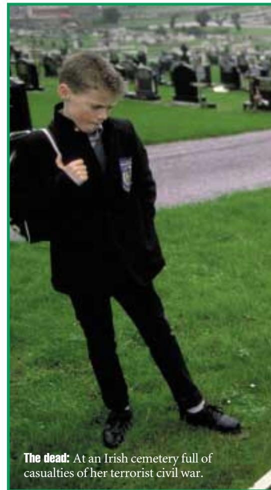
The dead: At an Irish cemetery full of casualties of her terrorist civil war.

Watch Indonesia and the world of radical Islam! Great change is on the horizon! ◆