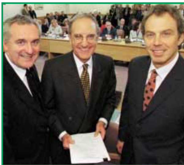
The sham: Ahern, Mitchell and Blair cement the Belfast Peace Accord after 22 months of negotiation.

The Belfast Peace Accord allows for Northern Ireland, which has been ruled directly by the British govern-