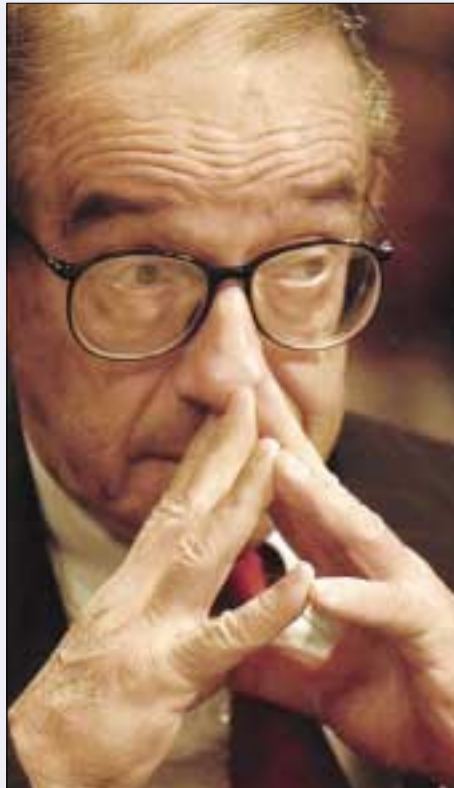
Hurricane alert: Greenspan predicts stormier waters ahead.

As usual in American politics, a great deception is occurring about the supposed “balanced budget” touted for the U.S. government’s next fiscal year. In spite of “balancing” the budget, the national debt is projected to grow from its present bloated size of $5.4 trillion to an even-worse $6.3 trillion in 2003. The reason is because the budget will NOT truly be