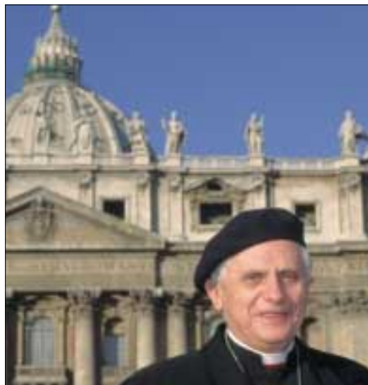
Prince of the Church: Cardinal Ratzinger holds the second most important post in Vatican City.

Styled the Panzer Kardinal by the German press, this controversial “Prince of the Church” demonstrates a brilliance of intellect and combative approach in attendance to his duties. Chief confidant and advisor to Pope John Paul II, the two have created a formidable team. In fact, it is the Panzer