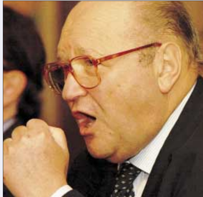
War over money: Ruggiero warns that bad policy decisions now could lead to the ultimate conflict.

"The trade body is concerned that the collapse in Asian countries' currencies will cause other nations [like China] to devalue [their currencies] to remain competitive, or will encourage governments to erect trade barriers to counter the increased price of imports." Mr. Ruggiero is then further quoted as saying, "The current situation is bad enough, but the greater danger is that