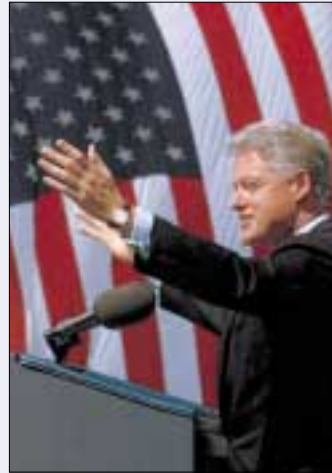
ON THE COVER: President Bill Clinton has the country on his side.

To America's Founding Fathers, character was everything.