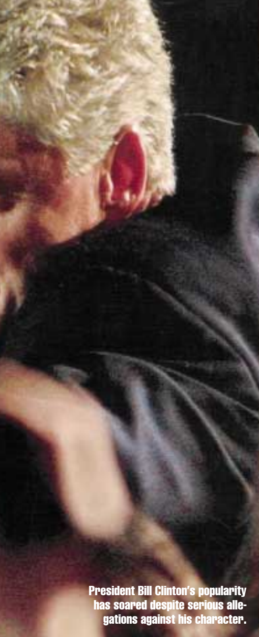
President Bill Clinton's popularity has soared despite serious allegations against his character.

mass media, the more they delivered, detail upon detail. And the more they served up raunchy intrusions into the core of Clinton's, and America's, private life, SO THE TIDE BEGAN UNBELIEVABLY TO TURN.