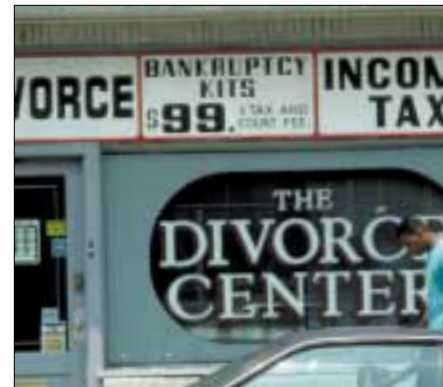
False advertising: Divorce is easy to come by—but hard to live down.

spoke with authority against divorce. The Pharisees were always challenging Christ. Here they tried to trick Him into speaking against Moses.