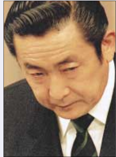
Going down: Hashimoto struggles with a depressive economy.

With the recent shakeup at Japan's Ministry of Finance (MOF), it is clear that things are happening in the Japanese governmental structure, but will it be enough? Two top career MOF bureaucrats resigned on January 29, two others committed suicide and another two were arrested on suspicion they took bribes in return for warning banks of coming inspections. The February 4 Wall Street Journal ran an editorial which makes an important point: "As Japan teeters on the brink of disaster...time is running out for Japan, and unless [Japanese Prime Minister] Hashimoto acts soon he risks being remembered as the man who presided over the decline of the world's second largest economy."