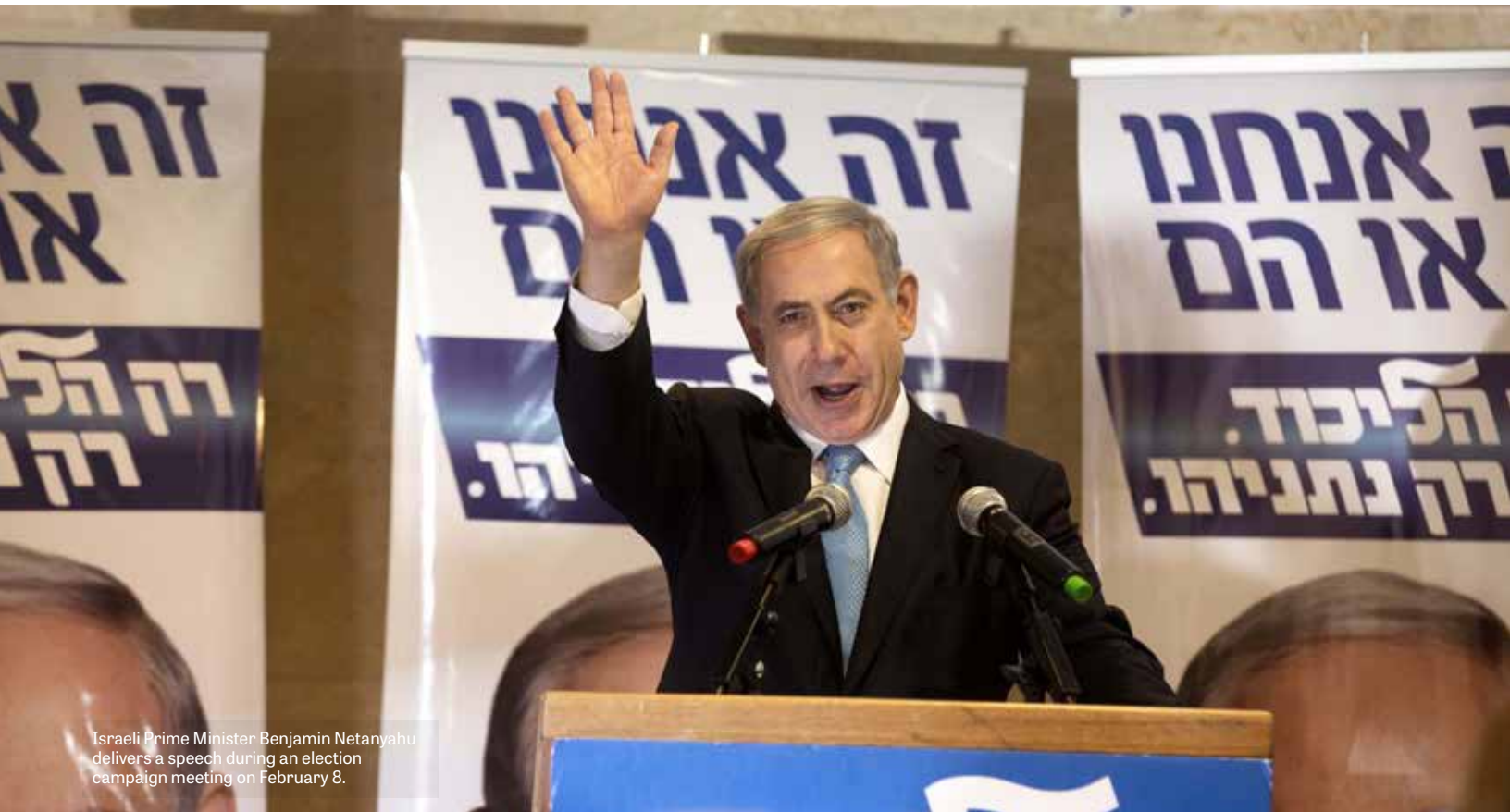
Israeli Prime Minister Benjamin Netanyahu delivers a speech during an election campaign meeting on February 8.