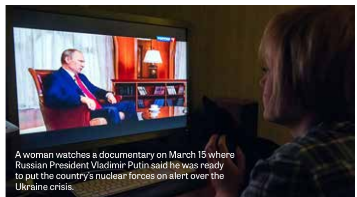
A woman watches a documentary on March 15 where Russian President Vladimir Putin said he was ready to put the country's nuclear forces on alert over the Ukraine crisis.

The broadcast of the documentary comes during a time of worries that Russia may soon attack the eastern Ukrainian city