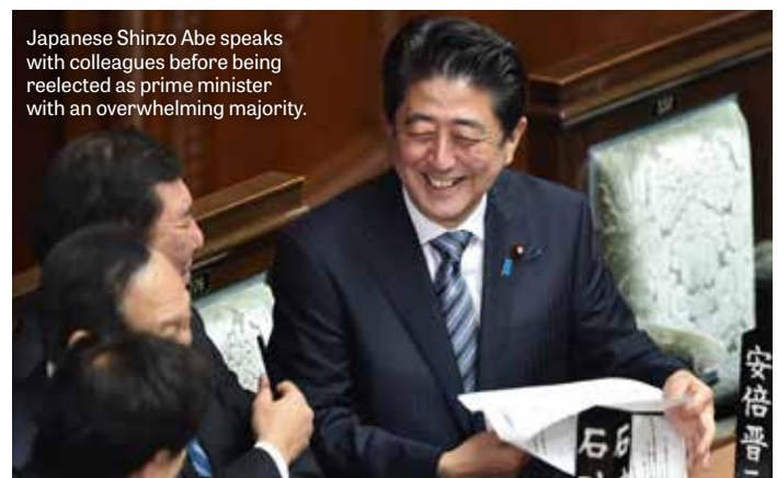
Japanese Shinzo Abe speaks with colleagues before being reelected as prime minister with an overwhelming majority.

Some Japanese soldiers were taken captive, but most fought until they were killed or committed suicide. The fanaticism spread even to Japanese civilians. By the end of World War II,