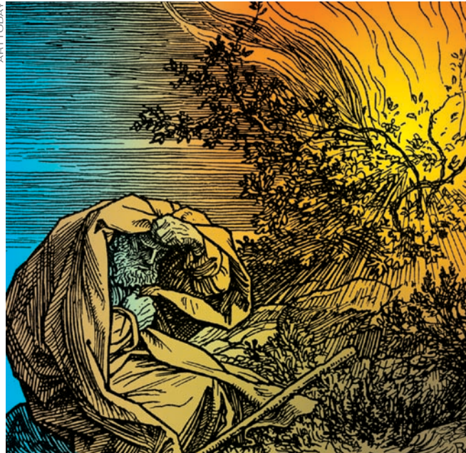
Moses witnessed a tiny portion of God's overwhelming greatness and power in the burning bush on Mount Horeb.

Although this verse has stirred up much controversy among scholars, essentially God was explaining the meaning of His name. God was giving the definition for the name LORD found in the King James Version. Other Bible versions translate LORD as Jehovah or YHVH. The name comes from the Hebrew word hayah , which corresponds with the English verb to be . God told Moses that He is the Eternal, Ever Living or Self-Existent One . This is God's name forever (verse