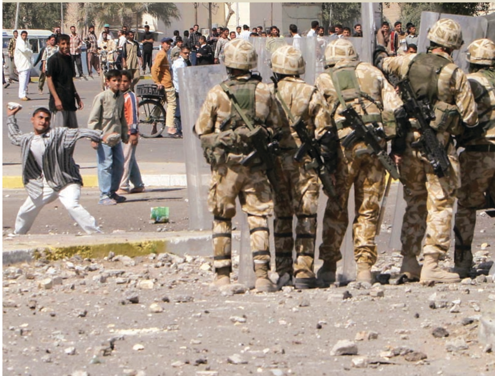
Iraqis cast their votes in a 2002 referendum on the Iraqi presidency. Saddam Hussein's likeness graces the ballot box; he ran unopposed.

T OPPLING A DICTATORSHIP IS ONE THING. Filling the leadership void with a functioning government is an entirely different matter. By the end of this month, though, the United States plans to hand over “sovereignty” to the Iraqi people. To what extent this will actually happen remains to be seen, but the current U.S. administration is committed to replacing the former autocratic regime with—drum roll, please—democracy.