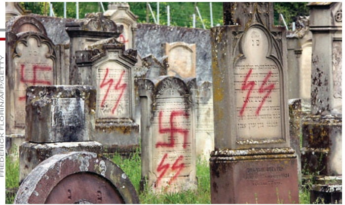
WHO IS RESPONSIBLE? Graffiti mars a Jewish cemetery in France.

For more on the prophetic implications of America’s troop realignment, please see our July 2003 article “Shuffling the Deck” under “Issue Archives” at www.theTrumpet.com .