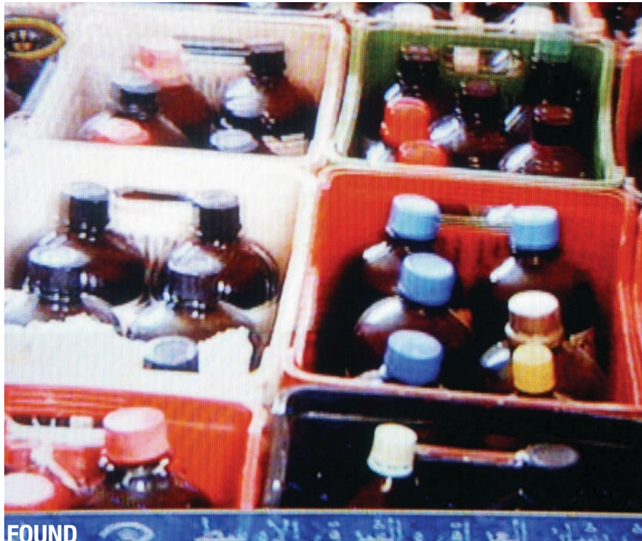
FOUND Jordanian television aired this picture of the chemicals al-Qaeda was planning to use in explosives against the Jordanian capital of Amman. Did they come from Iraq?

WHAT IF THE TERRORISTS HAD BEEN CAUGHT IN NEW YORK CITY OR WASHINGTON OR LOS ANGELES WITH 20 TONS OF