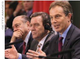
LEADERS France, Germany and Britain (L-R) have pushed for more active EU defense.

For more on Europe’s increasing military strength, please request a free copy of our booklet The Rising Beast .