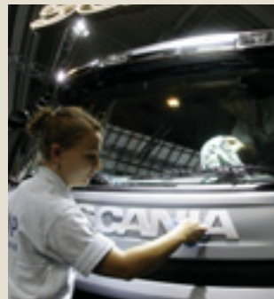
AT WORK Many Europeans are finding work as unemployment rates throughout EU member nations fall.

The Guardian summed up the situation this way: "The recent flow of news from around the world suggests that the balance of world economic power may finally be swinging away from the United States—the powerhouse of the past decade or more—toward Japan and Europe ..." (op. cit.).