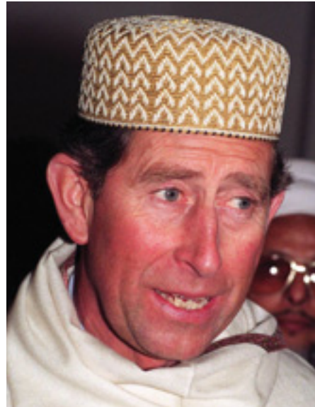
“DEFENDER OF FAITH” Prince Charles visits a mosque wearing a Muslim cap and shawl.

The irony is that, in purchasing the Islamist bill of goods regarding the evils of Western imperialism and so on, these opinion shapers are forced to overlook the evils of Islamist ideology—predominantly, that killing innocent people is a righteous act; not to mention its blatant contraventions of Western ideals such as women's