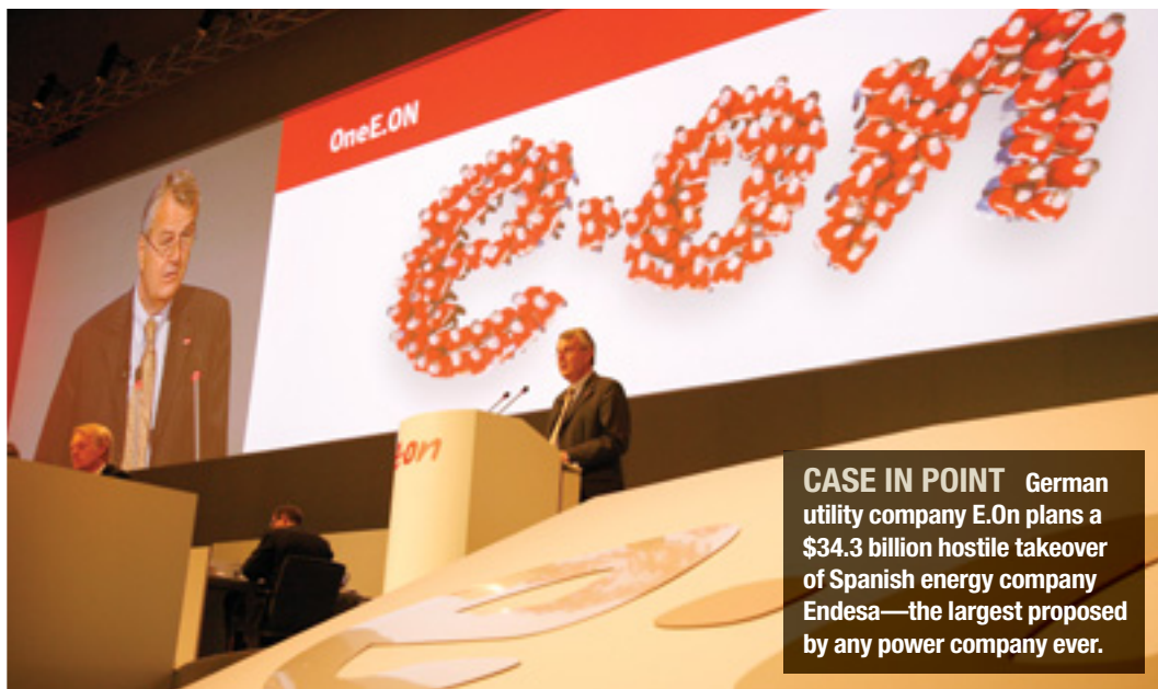
CASE IN POINT German utility company E.On plans a $34.3 billion hostile takeover of Spanish energy company Endesa—the largest proposed by any power company ever.

Meanwhile, as Germany's corporate giants restructured, they also focused on increasing their exports, largely within Europe. In fact, over the past 10 years, German enterprises have expanded their eurozone market share by over 25 percent—more than double that of their French rivals and more than 2½ times that of the Italians. Foreign sales have also allowed German corporations to become highly profitable. Both 2004