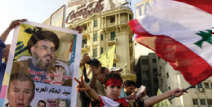
SUPPORTED Egyptians wave a poster reading "Master of the Arab leaders" in support of the Hezbollah militia.