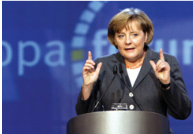
OPPORTUNITY Angela Merkel’s Germany will take the helm of the EU in 2007. “[E]xpectations for the German presidency are huge.”

Iran and its radical henchmen are thrusting the Middle East into crisis. Jerusalem is surrounded by Islamist enemies.