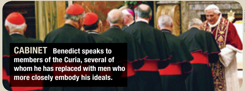
CABINET Benedict speaks to members of the Curia, several of whom he has replaced with men who more closely embody his ideals.