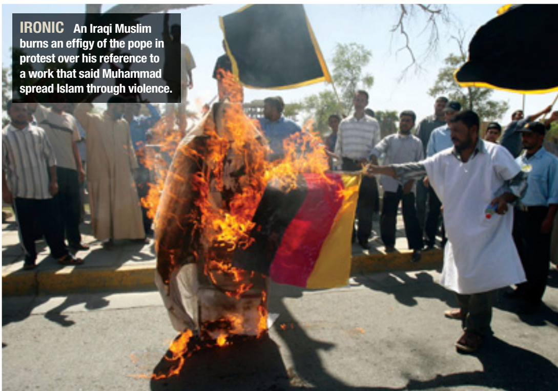
IRONIC An Iraqi Muslim burns an effigy of the pope in protest over his reference to a work that said Muhammad spread Islam through violence.

theme of the holy war. The emperor must have known that surah 2, 256 reads: ‘ There is no compulsion in religion. ’ ... [H]e addresses his interlocutor with a startling brusqueness, a brusqueness which leaves us astounded, on the central question about the relationship between religion and violence in general, saying: ‘Show me just what Mohammad brought that was new, and there you will find things only evil and inhuman, such as his command to spread by the sword the faith he preached. ’ The emperor, after having expressed himself so forcefully, goes on to explain in detail the reasons why spreading the faith through violence is something unreasonable. Violence is incompatible with the nature of God and the nature of the soul. ‘God,’ he says, ‘is not pleased by blood—and not acting reasonably is contrary to God’s nature. ... Whoever would lead someone to faith needs the ability to speak well and to reason properly, without violence and threats .... To convince a reasonable